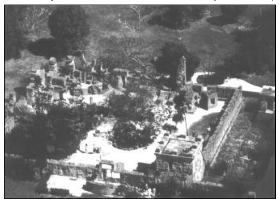
Aerial view of Coral Castle, Florida. The structure survived hurricane Andrew in 1992.

The Castle is entered through a nine-ton rock gate, which is perfectly balanced and swings open with very little effort. It sits on an old truck bearing and is held steady